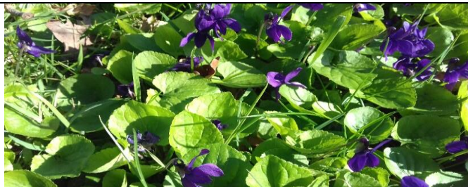
Sweet Violet (photo from 2021)